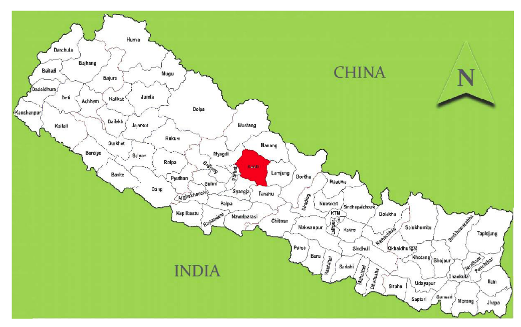
Figure 1: Map of Nepal showing the study site.

This research was carried out from February 5, 2014, to May 5, 2014, at buffalo production unit of Pokhara, District Kaski. This buffalo production unit is located at an altitude ranging from 640 to 770 meters