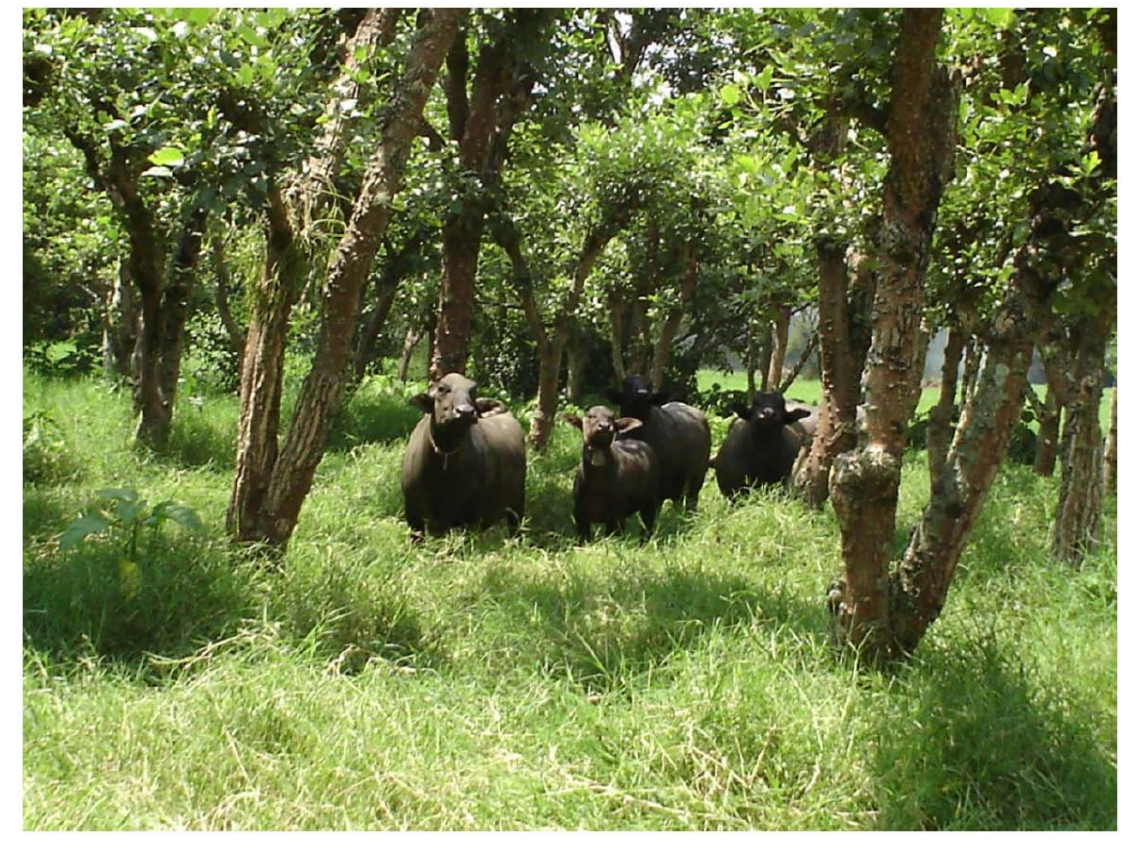
Figure 3: Water buffalo in silvopastoral systems in Colombia.

Cold-sensing neurons (A \beta and A \delta ) project into the midbrain lateral parabrachial nucleus (LPB), specifically to the lateral and central external subnuclei (LPBIa and LPBc). The LPBIa and LPBc neurons are tertiary afferent neurons that project in turn to the preoptic area of the hypothalamus (POA), mainly to the medial