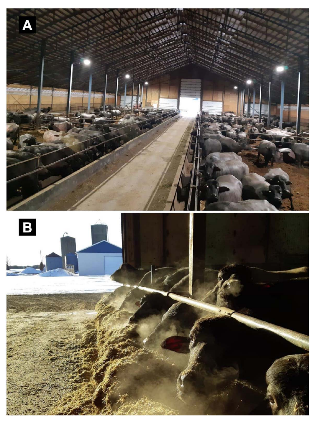
Figure 4: Dairy buffaloes in intensive production systems in Quebec, Canada. A ) Buffalo cows are housed in stables to protect them from sudden changes in temperature in winter; B ) Water buffalo increase their food consumption to maintain a higher metabolic rate and increase heat production.

may be responsible for this difference, if the surface is wet, resting behavior is inhibited.