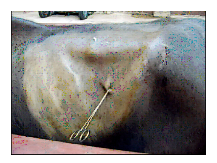
Figure 3: Assessment of flank analgesia.