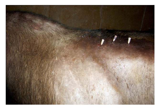
Figure 2: The needles in the injection sites.