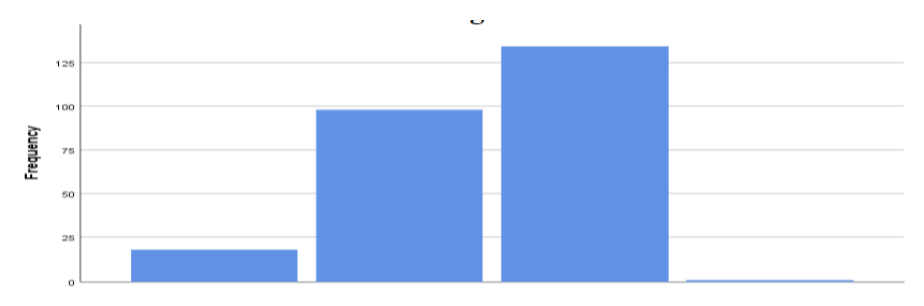
Figure 1: The production of Coffee Plantation.

In the above diagram, it can be seen that the tendency of other communities started getting involved in the coffee. Therefore, the interest related to coffee plantation ownership has been increasing significantly in recent years. It was more than 50% of coffee plantation ownership is currently obtained from the buying and selling process, not from inheritance. It means that the ownership of coffee plantations has now begun shifting from the local community to the new comers. This means that coffee is a pure business by exploiting labors and capital to increase productivity for profits.