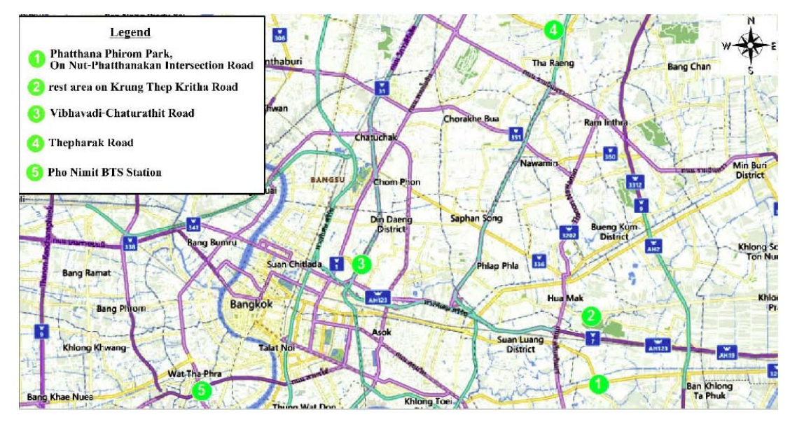
Figure 4: Map of the risk areas with the most common juvenile motorcycle drag racing cases.

As shown in Figure 4, the results reveal the risk areas with the most common juvenile motorcycle drag racing cases are as follows:(1) Phatthana Phirom Park, On Nut-Phatthanakan Intersection Road; (2) the rest area on Krung ThepKritha Road; (3) Vibhavadi-Chaturathit Road; and (4) Thepharak Road (5) Pho Nimit BTS Station.