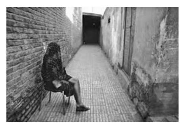
Figure 10: Kaveh Golestan, nameless, from the series of the Prostitutes, photo, 1975-77.

Take a look, for example, at Figure 11, we see a jealous looking of a worker looking at the published image of the Shāh and Empress Farah stood next to President Jimmy Carter (1924) and his wife during their visit from Iran; all dressed in prestigious colorful clothes. The photo depicted an obvious paradox between the pretty world in which the royal family lived and that of the poor workman and his comrades.