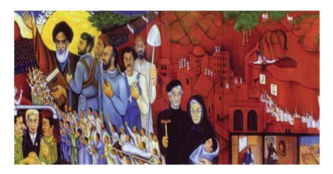
Figure 22: Bahram Dabiri, An Illustration of the Islamic Revolution, Oil painting on canvas, 140 X 700 cm, 1980.