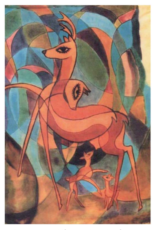
Figure 20: Bijan Jazani, Life, painting, date?

At that time, there was also a new generation of artists who were ideologically close to Islamic groups