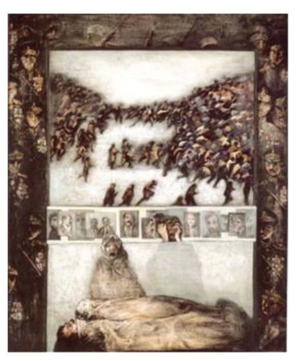
Figure 5: Akbar Behkalam, They expected a different life when the Revolution began, Persepolis series, oil painting on canvas, 1979.

The Persepolis series is a mixture of Realism, Expressionism as well as Persian miniatures, with the presence of motifs inspired from engraved on the walls of Takht-e-Jamshid which was internationally well-known thanks to the Shiraz Festival of Arts. Behkalam placed these motifs together with contemporary images from the Shah's era, for example, figures of torturing and murdering among parades of ancient Persian soldiers. The title and these motifs were selected very cleverly to depict the paradox of the glory of the great Persian people, the image that Shāh tried to show to the world by celebrating 2500th year of the foundation of imperial of Iran, and human rights violations that had been taking place by the shah's government.