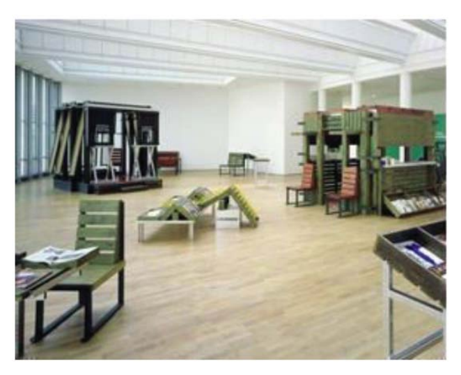
Figure 1: Sia Armajani, Sacco and Vanzetti Reading Room, installation, Kunsthalle Basel and Stedelijk Museum Amsterdam, 1988.

As audiences of the work, who know the story of Sacco and Vanzetti, we can say that the artist has dedicated his work to Sacco and Vanzetti as a tribute to his protest comrades who were victims of prejudice. due to their political ideas. People whose destiny was similar to that of the artist, those who escaped from Iran, or arrested and sentenced to prison or death. The choice of a reading room to stage the installation was very intellectual and conveyed the artist's message clearly that is the only way to reach absolute truth about thoughts and actions of characters like Sacco and Vanzetti is through wisdom. You probably wonder why Armajani has chosen two Italian Anarchists for his work instead of two Iranian protests? The answer is that these two characters are famous in contemporary political history. They are the symbols of people who are judged and prejudiced discriminately. If Armajani had cherished two lesser-known Iranian characters. those who were executed during post-coup years, in his work, he would not have been able to communicate with international audiences anywhere, (Zabolinezhad 2018).