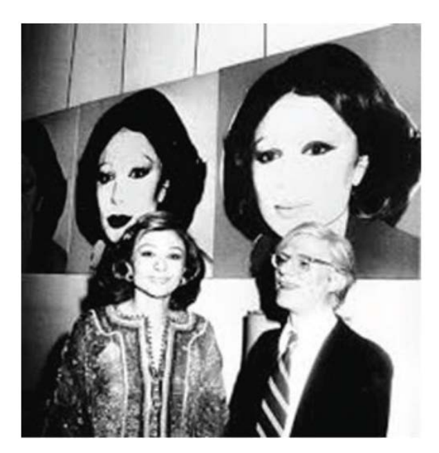
Figure 2: Photo of Empress Farah and Andy Warhol, standing in front of Warhol's work, which was torn apart by the revolutionaries during in 1979, Tehran Museum of Contemporary Arts, 1977.

Another cultural annual ceremony held by the initiative of Empress from 1967 to 1977 in Perspolis, was the International Festival of Arts (Persian: جشن هنر شيراز). Persepolis, the capital of the Persian Empire of Achaemenid is near Shiraz, and the ruins of the great royal city called Takht-e-Jamshid (in Persian: or the Throne of Jamshid was an ideal تخت جمشيد location to perform the festival's programs included dance, drama, showing film and music. Musicians,