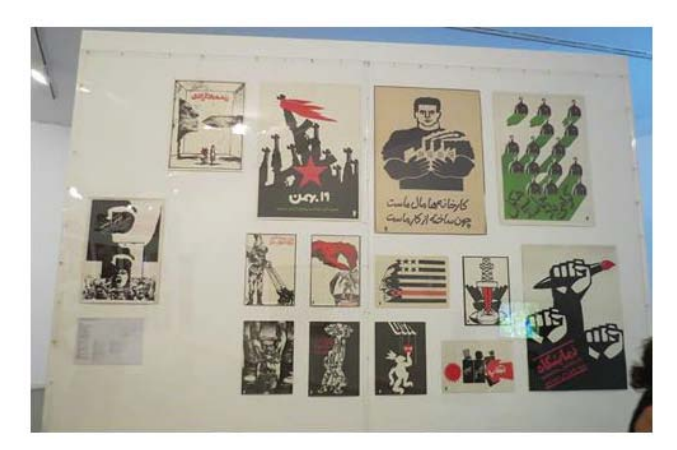
Figure 8: Posters created by the protest artists, from 1953 Coup to the Islamic Revolution in 1979, the exhibition UNITED HISTORY Séquences du moderne en Iran de 1960 à nos jours, the Socialist Realism School, Museum of Modern and Contemporary Art of the city of Paris, July 2014.

They also dedicated a hall to propaganda practices with political subjects, made by protest artists against the Pahlavi regime (See Figure 7-9).