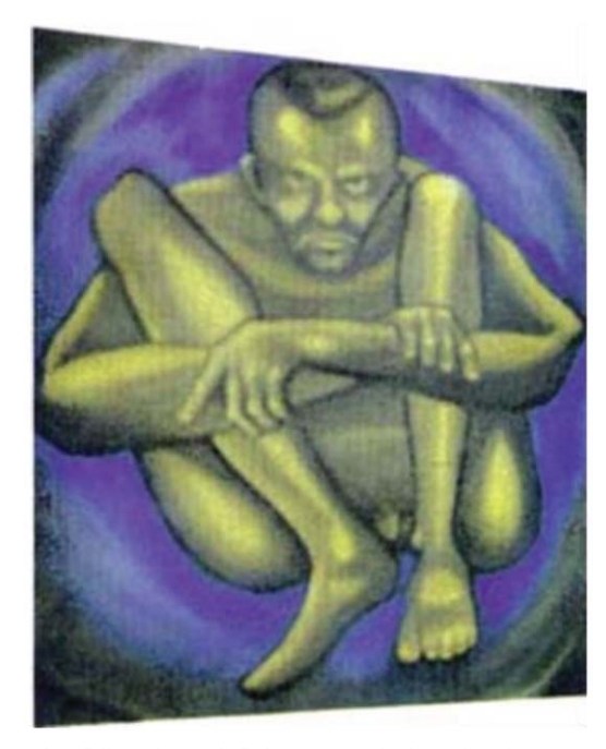
Figure 19: Bijan Jazani, Prisoner, painting, 1971.

cell as a womb that surrounds him. He shows himself as a fetus, squatted but sensible at the same time, waiting for an upcoming destiny that is becoming free from this dense uterus. A hope that unfortunately never came true for him.