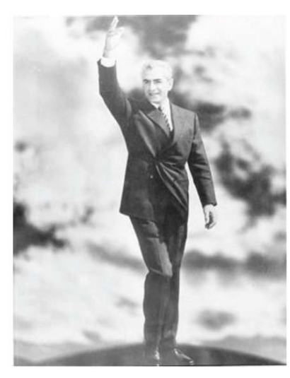
Figure 6: Famous propagandist photo of the Shāh, published in newspapers at the time of the White Revolution, 1963.

predominant topic of their works was usually the posters. Their works also were strongly under the influence of the Socialist Realism School, an official style in the Union of Soviet Socialist Republics (USSR). It depicts the communist ideologies such as encouraging people to fight against Capitalism, corrupted government of the Shāh who was the symbol of depravity. Some visual artists portrayed the USSR as a Utopia where the citizens' demands are perfectly satisfied.