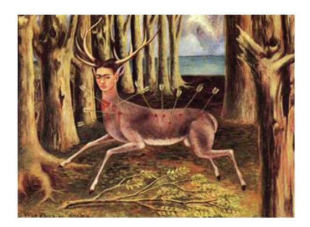
Figure 18: Frida Kahlo, The wounded deer, painting, 1946.

The calm gestures of gazelles and the use of living colors in the painting titled Life, confirms the fact that the world of Jazani was not black and depressing. He was waiting for a new time to come in the hope that the Pahlavi regime would fall soon (See Figure 20).