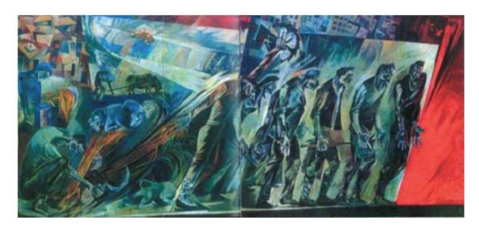
Figure 28: Nosratollah Moslemian, Immigration, Oil painting on canvas, 1977.