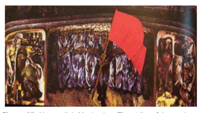
Figure 27: Nosratollah Moslemian. The strike of the workers of the Petroleum Company, Oil painting on canvas, 1979.