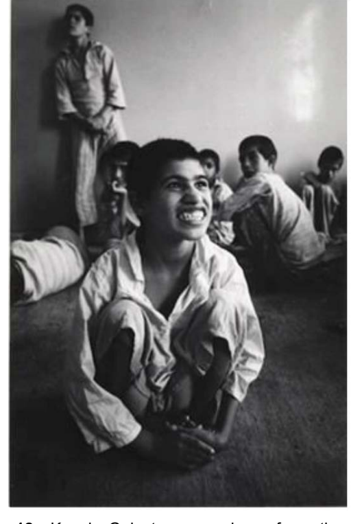
Figure 12: Kaveh Golestan, nameless, from the Mental handicap series, photo, 1975-77.