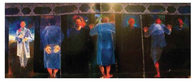
Figure 25: Hossein Khosrowjerdi, Hay Ali Al-Falah, Oil painting on canvas, 1978.

Like Nosratollah Moslemian (1953), a revolutionary painter, has created several works with Revolution and protest related subjects, by applying a mixture of Expressionism and Fauvism styles. Compared to the other Moslemian's contemporary artists, whom practiced revolutionary-related subjects in their works, his unique style has made his works prominent. Moslemian used strict paint stains along with thick