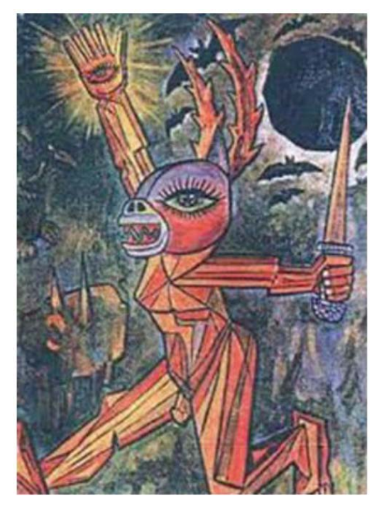
Figure 17: Bijan Jazani, Siyahkal, painting, 1971.

stunningly, there are a few nuances. For example, the gazelle in Frida Kahlo's painting has gestures that differ from the aggressive deer in the Siyahkal painting.