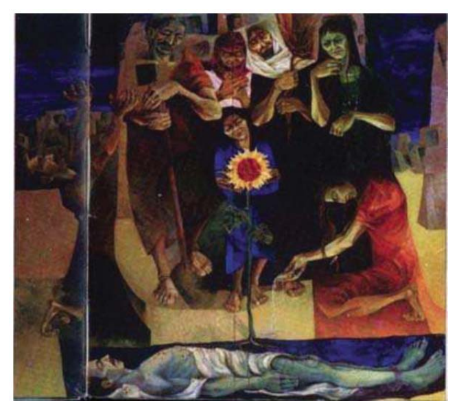
Figure 24: Ayoub Emdadiyan, Sapling of Freedom Oil painting on canvas, 1976.