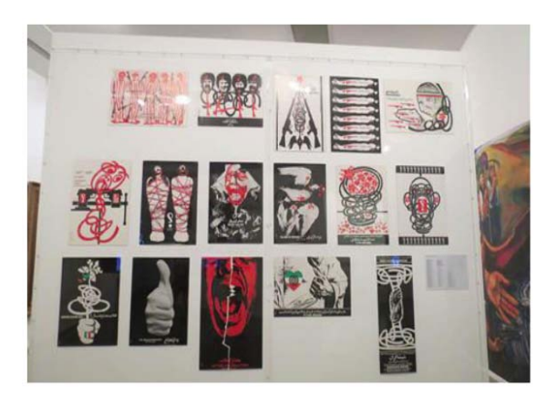
Figure 7: Posters created by the protest artists, from 1953 Coup to the Islamic Revolution in 1979, the exhibition UNITED HISTORY Séquences du moderne en Iran de 1960 à nos jours, the Socialist Realism School, Museum of Modern and Contemporary Art of the city of Paris, July 2014.

The following photos were taken by the first authors during her visit from the exhibition of Museum of Modern and Contemporary Art in Paris, July 2014, titled UNITED HISTORY Séquences du moderne en Iran de 1960 à nos jours, where the organizers displayed some practices of modernists and contemporaries Iranian artists of different generations.