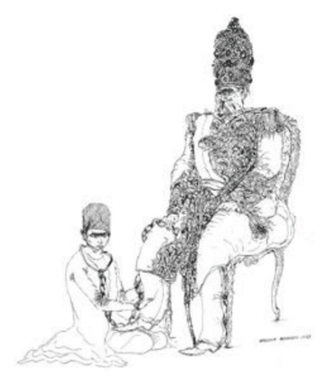
Figure 15: Ardeshir Mohassess, The King and I, from the Series of life in Iran, drawing on paper, Library of Congress, United States, 1978.

essential socio-political changes have occurred and main characteristics of the Pahlavi regime are identical to that of Qajars. Drawing upon Persian folk art, miniatures, and 19th-century lithographic illustrations, which were practiced after the introduction of lithography print to Iran in the 1850s, Ardeshir produced an extraordinary volume of work portraying current events and everyday life of people. He often combined lithographic illustrations of Šāh-nāma, as well as religious lore and literary books, and complemented them by his unique sense of humor. His illustrations, arguably the best in the style, were often created for editorial pages of newspapers and periodicals. Influenced by multiple sources they were minutely detailed, heavily hatched, and crosshatched. In 1976 Mohassess traveled to New York City again where he developed a special technique for articulating subjects like human rights and socio-political freedom in the different countries as well as Iran by a few strokes of lines in ink or by pencil in a satirical manner. One can never change anything by art, Mohassess said in 1973. The only thing one can say is that artists in each period of history leave a record so that people in the future will know about their time. Just like his older brother, Ardeshir preferred to leave Iran because of the extreme censorship impose by the secret police of the regime, SAVAK, to live in New York for his remaining years.