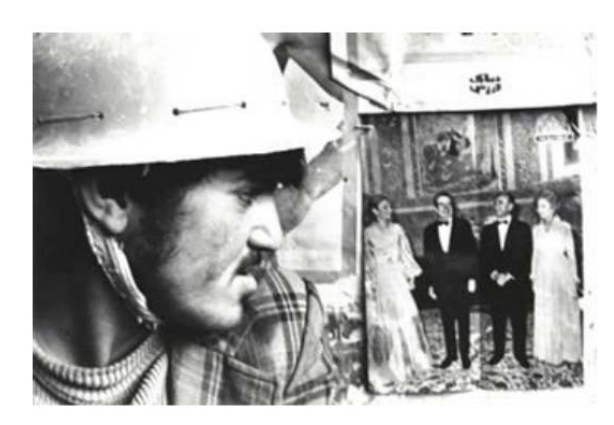
Figure 11: Kaveh Golestan, nameless, from the Labor series, photo, 1975-77.