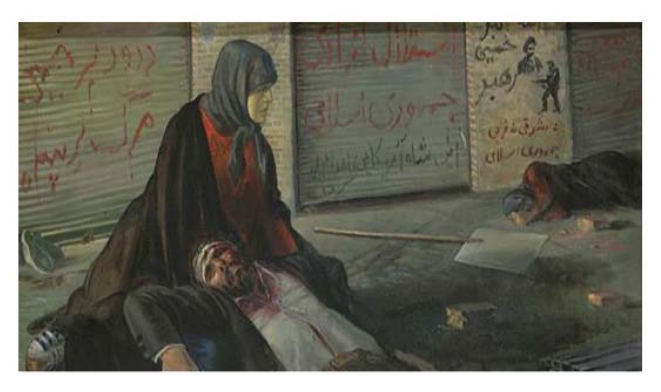
Figure 23: Kazem Chalipa, Black Friday, Oil painting on canvas, 1979.