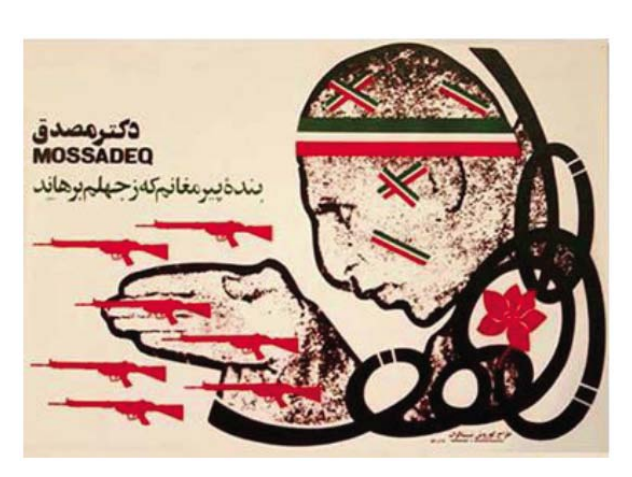
Figure 9: Kourosh Shishegaran, a poster displayed in Figure 7, in the upper right, there is a picture of Mossadegh wearing a forehead of a flag of Iran without the acronym of the Pahlavi. There is also a text next to the picture, a part of a famous poem, saying "I am a servant of wisdom man (the elderly man of the Moghs) who made me free from ignorance."

At the end of the Qajar dynasty (1796-1925), the increased number of foreigners who came to visit Iran, those who brought new thoughts about freedom and human rights with themselves, as well as an increased number of published newspapers, led to the advent of intellectualism and a new type of socio-protest art in Iran that was Caricatures. The caricature was the only form of protest arts produced by activists and social movements until the mid of Pahlavi regime. Although posters with politics and revolution related subjects, which have designed between the 1953 Coup and the 1979 Islamic Revolution are an important part of the