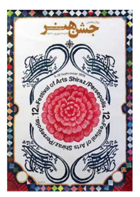
Figure 3: Ghobad Shiva, Poster of the 12th Shiraz Festival of Arts, from 3 to 12 September 1978, canceled because of the great strikes of the revolutionaries.

Another cultural annual ceremony held by the initiative of Empress from 1967 to 1977 in Perspolis, was the International Festival of Arts (Persian: جشن هنر شيراز). Persepolis, the capital of the Persian Empire of Achaemenid is near Shiraz, and the ruins of the great royal city called Takht-e-Jamshid (in Persian: or the Throne of Jamshid was an ideal تخت جمشيد location to perform the festival's programs included dance, drama, showing film and music. Musicians,