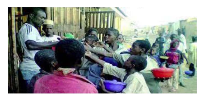
Figure 1: Almajiri Children Begging for Arms in Kano State.

be learning Quran, but the evidence shows that most of them resort to begging for arms for their survival. This makes them prone to social vices and readily available to be used by extremists and other anti-state organizations to attack the state. This claim had been foreseen by Falola (2009) and Umar (2013) who revealed that the Almajiri system is prone to political violence, criminality, and insurgency. One of its inherent challenges is the radicalization of the young children under the Almajiri system by their Mallams, the majority of whom share the same ideology with the extremists (Purefoy, 2010).