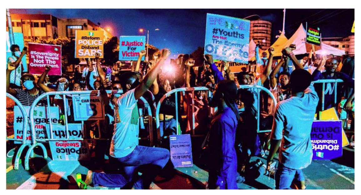
Figure 2: Protests against the Special Anti-Robbery Squad (SARS) in Nigeria. Duerksen, (2021).