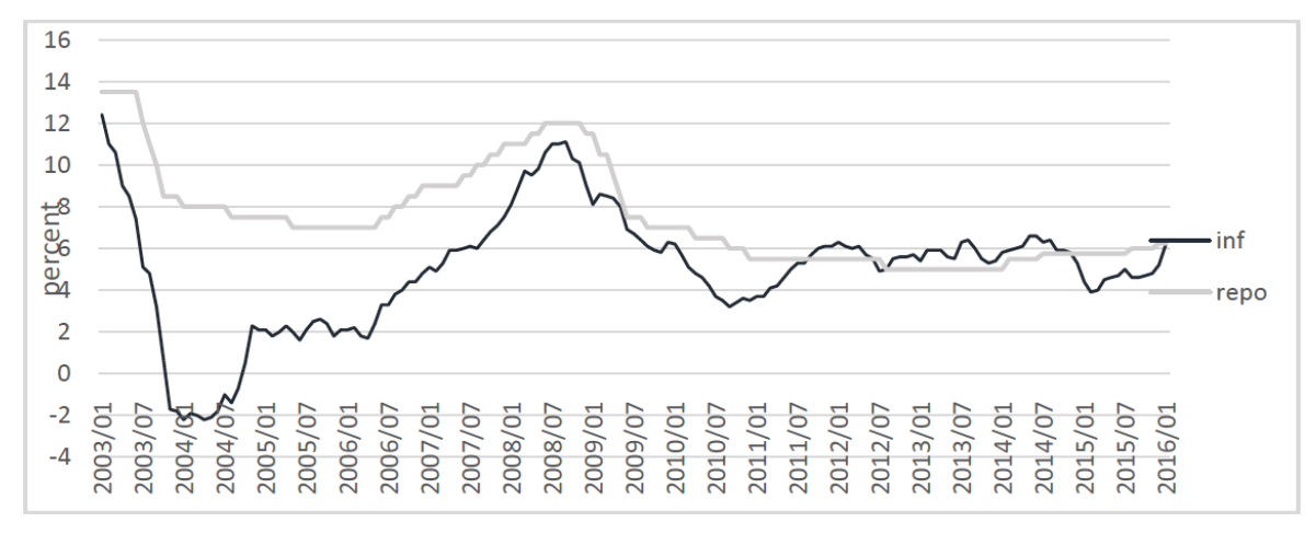
Figure 3: Inflation and the repo rate in South Africa (2003:q1-2016:q1).

Our empirical study uses 5 measures of monthly collected of aggregated inflation from 2003:01 to 2016:01 collected from the South African Reserve Bank (SARB) online database. The inflation data includes i) total CPI: memorandum item (memo) ii) total CPI: Administrative prices (admin) iii) total CPI (total) iv) total consumer prices of commodities (goods) v) total consumer prices of services (services). For empirical purposes we further segregate our empirical data into subsets, the first corresponding to periods prior the peak of the subprime crisis (2002:01 to 2008:06) and the second corresponding to periods subsequent to the subprime crisis (2008:07 to 2016:01). As a means of measuring inflation persistence, we follow in pursuit of Rangasamy (2009) and estimate the follow uni-variate autoregressive (AR) process of an inflation time series (\pi_t) :